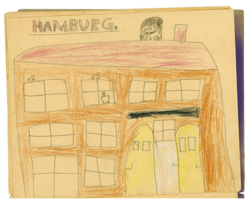
Figure 1 and 2: