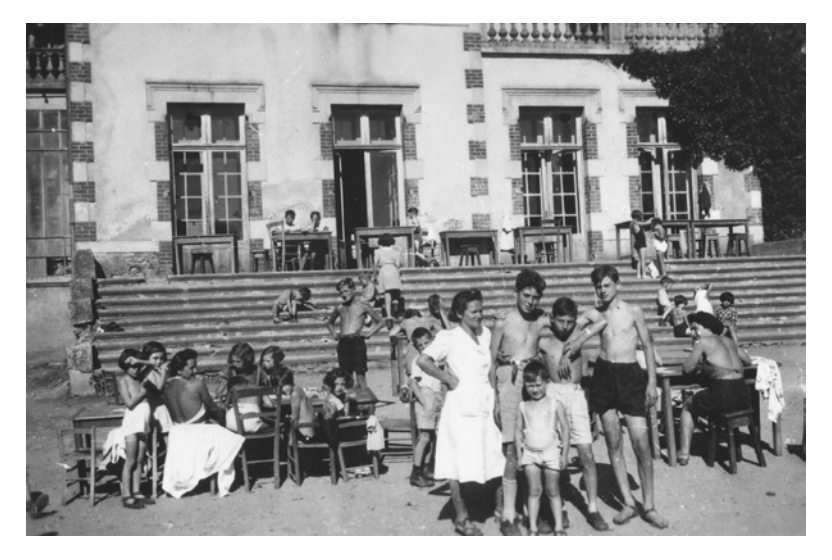
Figure 1: The Chabannes home on the day of the August 26, 1942 round-up. (USHMM, Photo Archive Number: 37921)