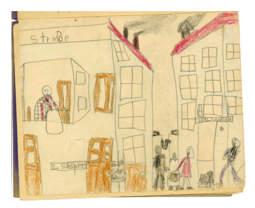
Figure 4: Archive of the Israelitische Töchterschule, 08:H22 (8)

On another page (Figure 4), Popper draws a street scene. We see the fronts of multi- story houses. Doorsigns indicate that several families live here. Another sign points to the entrance of the toy shop, whose display can be seen through the open door. In another open window, a person is airing textiles. People are walking on the street, perhaps they are in a rush to catch the train waiting between the houses. Here, Popper draws a condensed panorama of urban life which we also know from the study Der Lebensraum des Großstadtkindes (The Life Space of the Urban Child) by Martha Muchow.<sup>57</sup> Muchow's pioneering work from the 1930s describes the everyday life of working-class children in the Barmbek district of Hamburg.<sup>58</sup> She gives a dense picture of how children moved in urban