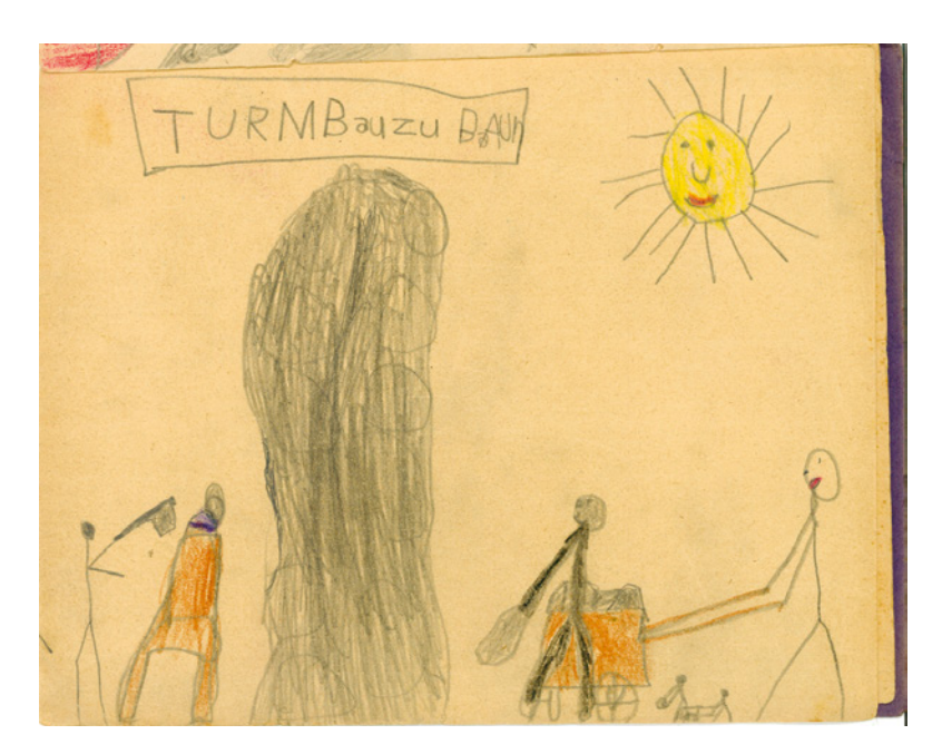
Figure 5: Probably "Tower of Babel" ("TURMBau zu BAUN"). Source: Archive of the Israelitische Töchterschule , 08:H22 (6).

time, strives for harmony of their whole personality through empathy and a grasp of all the values of German culture and its relations to the European and general educational heritage. <sup>68</sup>